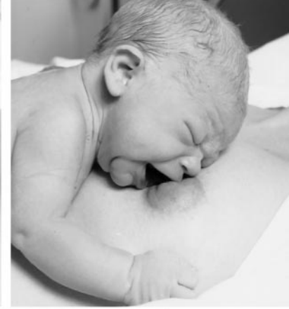
Fig 1. An infant boy <1 hour old crawls up his mother's body and latches onto her breast by himself, clockwise from left.